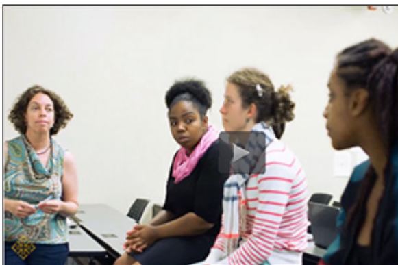
Bringing Group Work Online