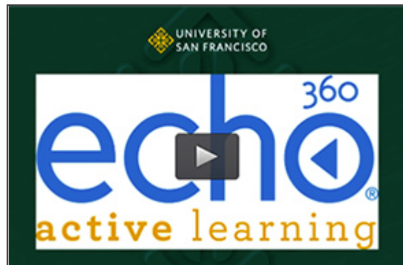
Flipping the Classroom With