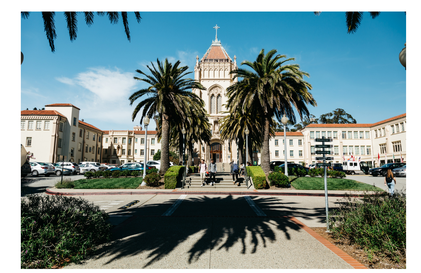
WEEKLY UPDATE - Aug. 23