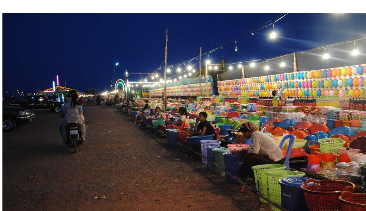
Submission by Maeve Harding from the 2011 Photo Contest